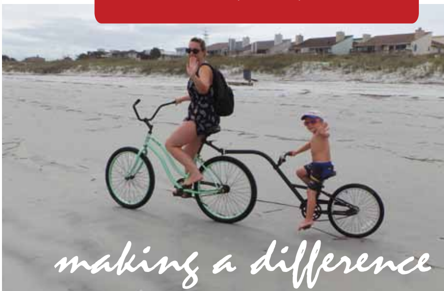
Below: Outings with mum whilst receiving proton beam therapy in the US.

The Trustees present their report and accounts for the period from 1st April 2015 to 31st March 2016. The accounts comply with the requirements of the Charities Act 2011, RGF's Trust Deed dated 16th January 2014 and the Financial Reporting Standard for Smaller Entities (FRSSE).